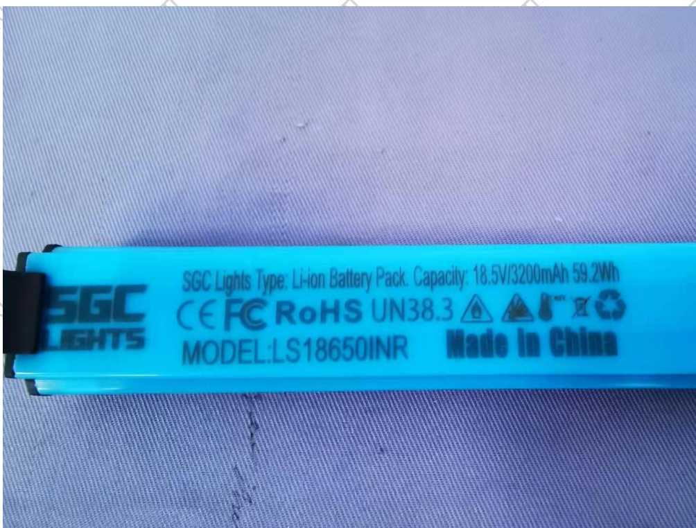
Figure 4 Battery label