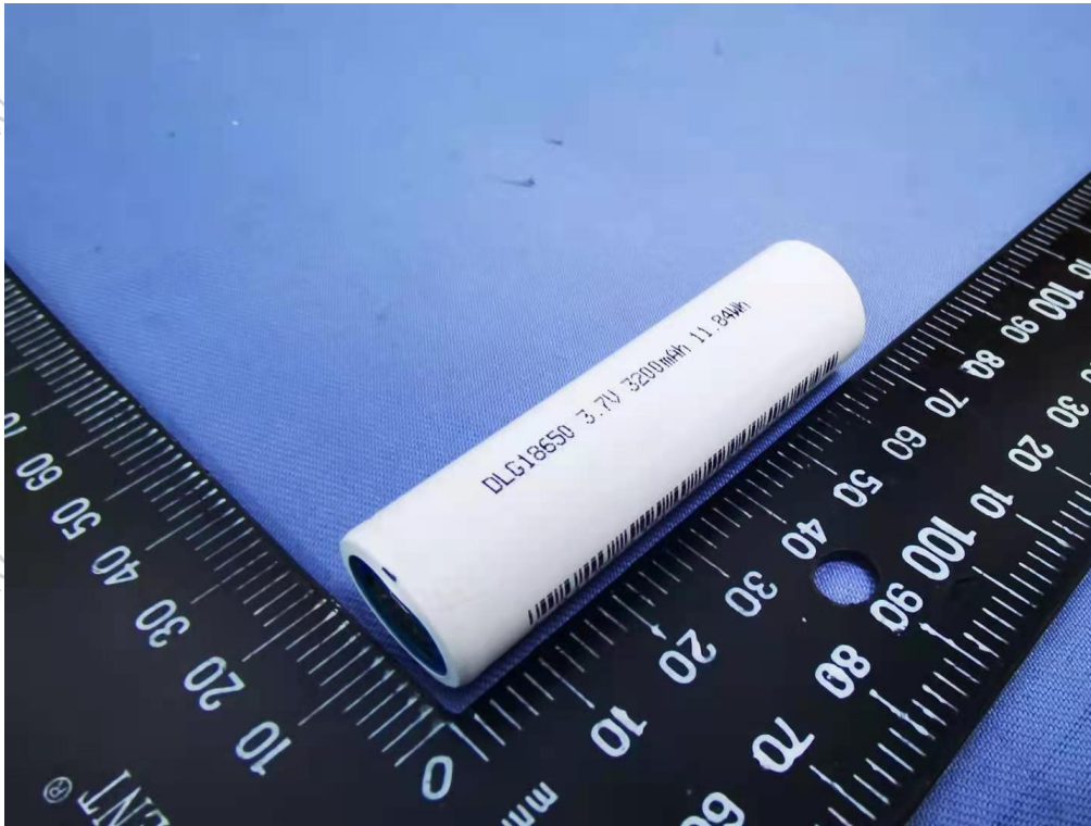
Figure 3 Overall view of cell